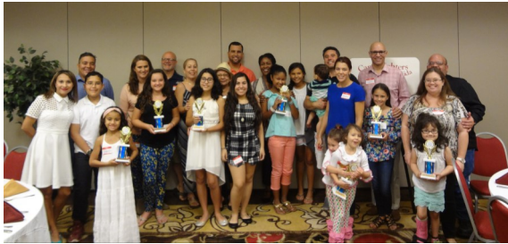
Candlelighters No More Chemo Celebration

Candlelighters understands parents of children with cancer or blood disorders are often young with a very limited income with other children. This is why we provide all services at no cost to the entire family.