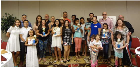
Candlelighters No More Chemo Celebration

Candlelighters understands parents of children with cancer or blood disorders are often young with a very limited income with other children. This is why we provide all services at no cost to the entire family.