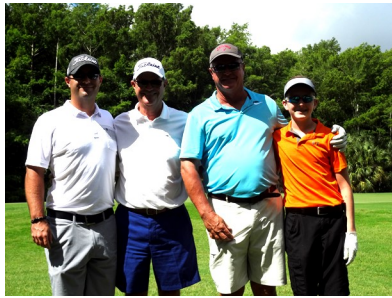
In support of Childhood Cancer Survivors

Candlelighters understands parents of children with cancer or blood disorders are often young with limited income and have other children in the household. This is why we provide all services at no cost to the entire family.